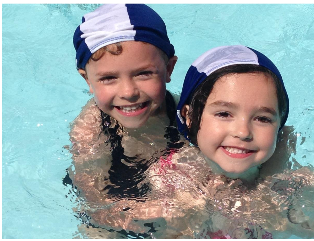
..... the Sensory Room and much, much more!

Learn together, grow together www.coombehillinfants.com