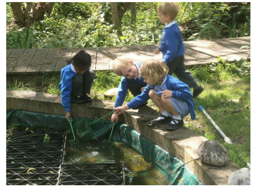
the Log Cabin and the pond