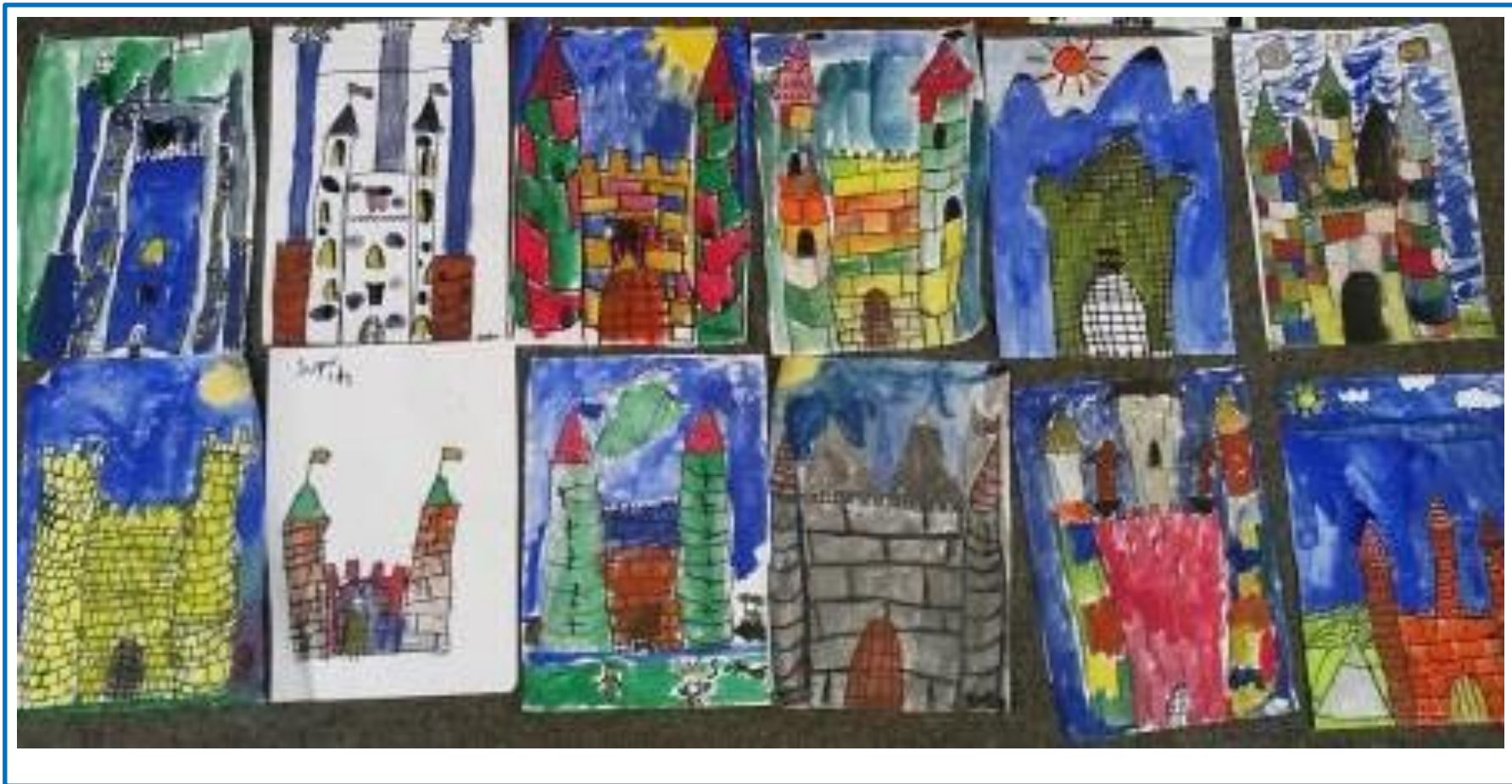
Some of our Year 2 art work on their 'Castle' project and their trip to Windsor castle.