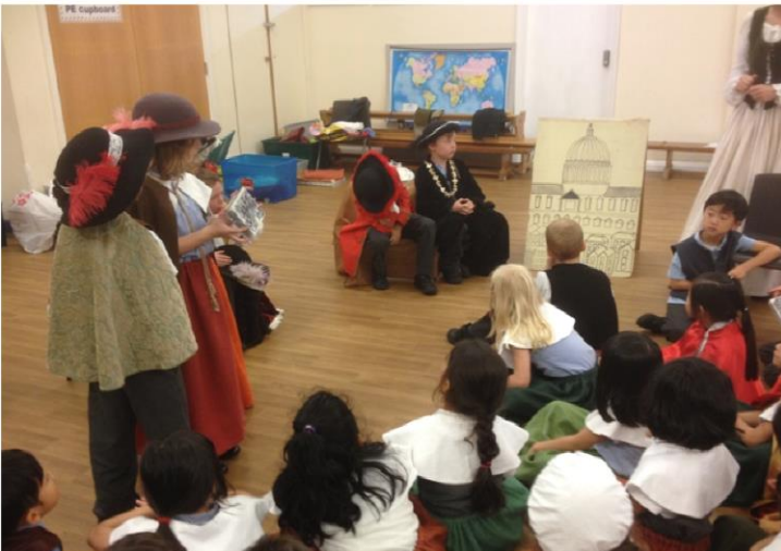
Matrix Theatre – The Great Fire of London