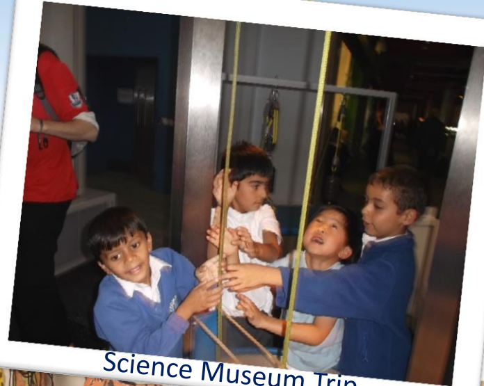
Science Museum Trip