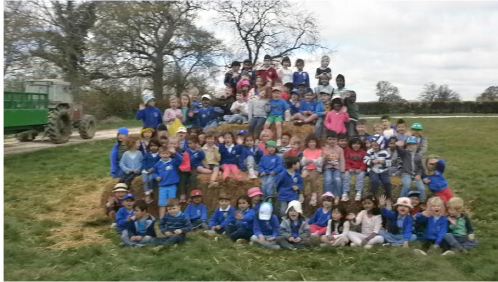
Ladyland Farm Trip