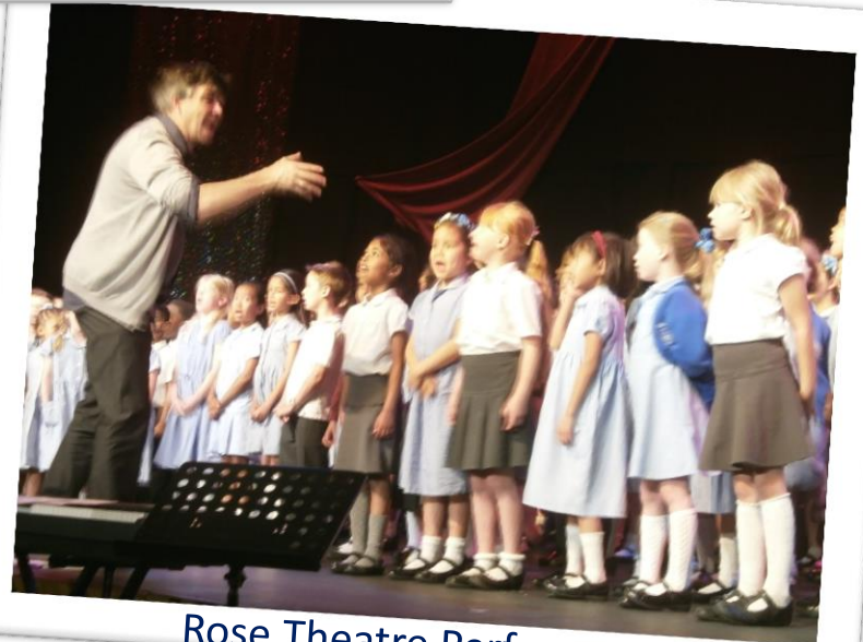
Rose Theatre Performance