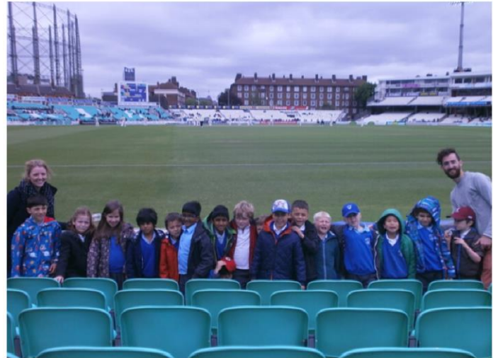
Future Cricketers at Lords!