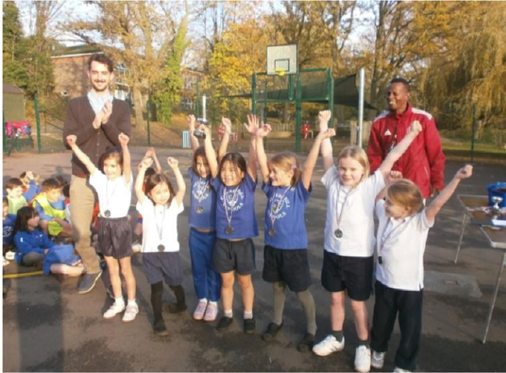
The Future Girls' England Football Team!