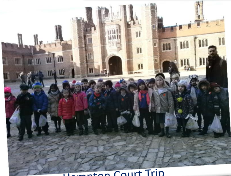
Hampton Court Trip